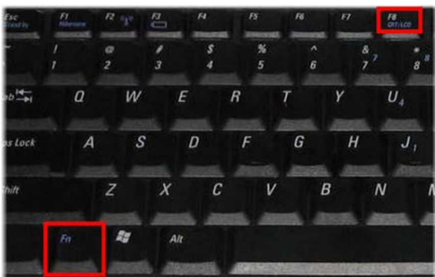
DELL Fn and F8