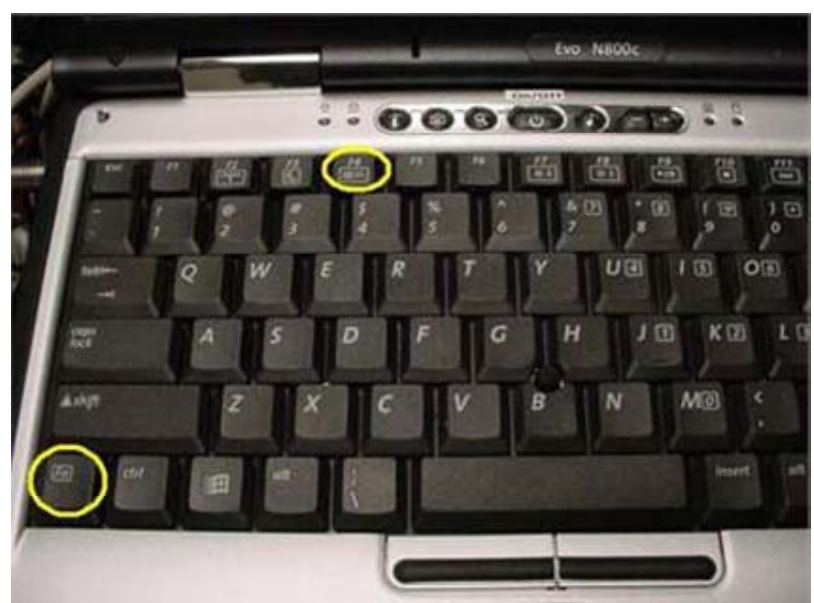
HP FN and F4