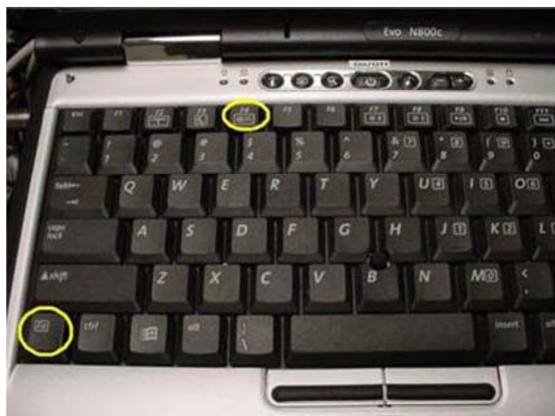
HP FN and F4