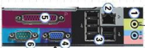
Back of the computer

2. VGA CABLE from Output 1 on Kramer Box goes to Back of Monitor/ Computer Screen